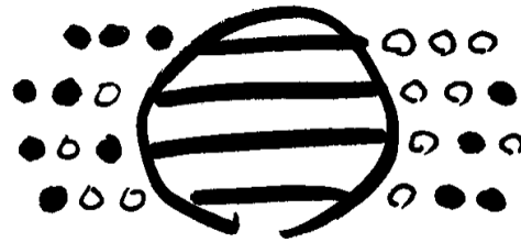
Figure 5. Glass Pyramid diagram revealed by crayon rubbing

Crayon rubbings of the etching revealed a combinatorial diagram of great profundity, all but swallowed by the time-worn surface: a circular arrangement of dots connected by horizontal bars (Fig. 5). I recognized the dots as early "settler notation" for binary numbers -- in fact, they were trigrams! The primeval image positioned each trigram on a circle, with its trigram complement on the other side; the bars connected pairs of complements. Traversing the circle clockwise, cycled through the eight trigrams in linear order. This was a complex, pithy diagram comparable to Fig. 3.