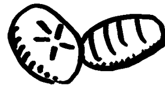
Figure 2. Zephyrian fire seeds

The obtained trigram and its associated haiku suggest a practice to inform both your thoughts, and your actions. The ancient belief was that trigrams encode clocking synchronicities and trends attached to your path in the simulation. A trigram represents the oracle’s best fit estimate of the moment you are embedded in, and how to proceed.