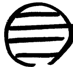
Figure 4. Galaxian Sacred Symbol