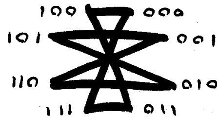
Figure 3. Mandala ordering

So the binary trigrams alone can speak directly to the user, and offer guidance, even without the accompanying verses.